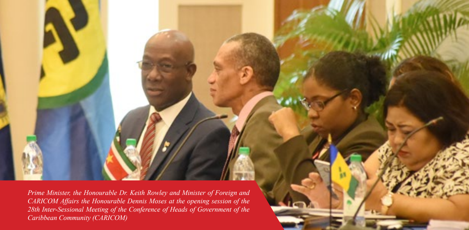
Prime Minister, the Honourable Dr. Keith Rowley and Minister of Foreign and CARICOM Affairs the Honourable Dennis Moses at the opening session of the 28th Inter-Sessional Meeting of the Conference of Heads of Government of the Caribbean Community (CARICOM)