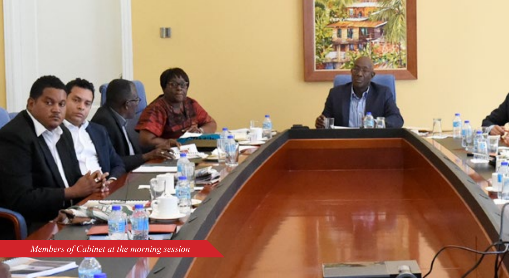
Members of Cabinet at the morning session