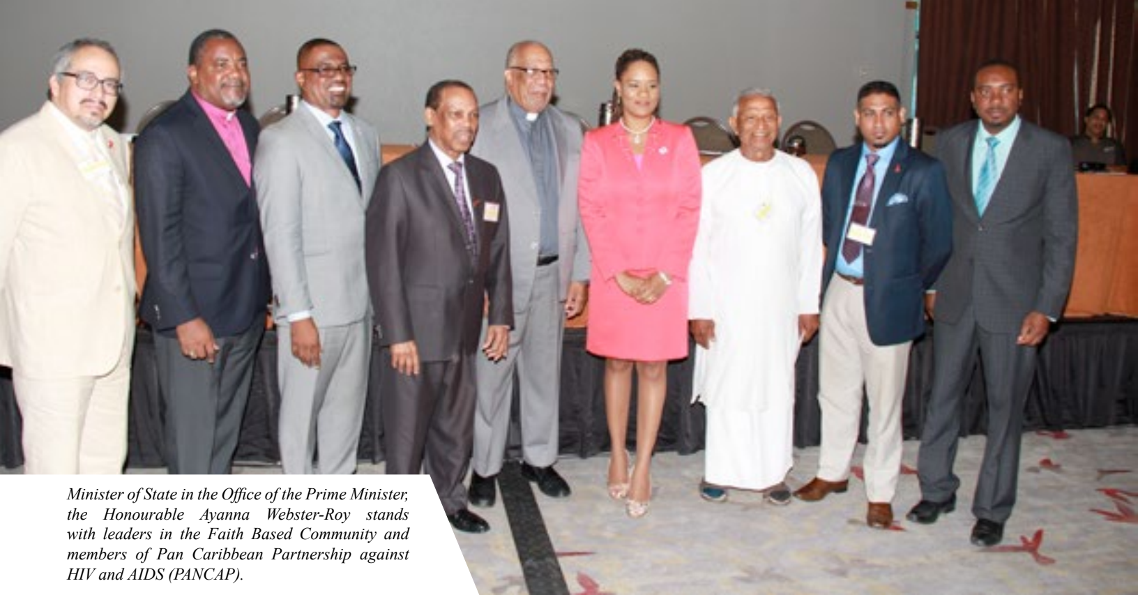
Minister of State in the Office of the Prime Minister, the Honourable Ayanna Webster-Roy stands with leaders in the Faith Based Community and members of Pan Caribbean Partnership against HIV and AIDS (PANCAP).