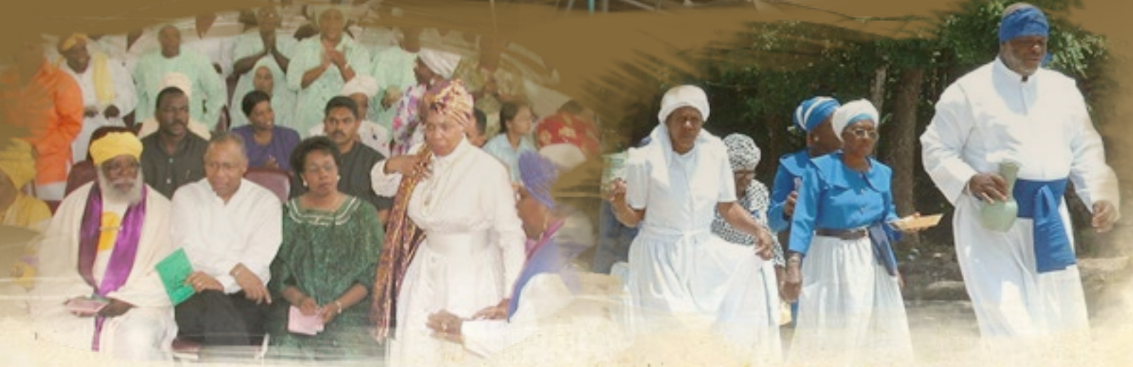
Former Prime Minister Patrick Manning during a 2003 Spiritual Baptist/ Shouter Liberation Day celebration.