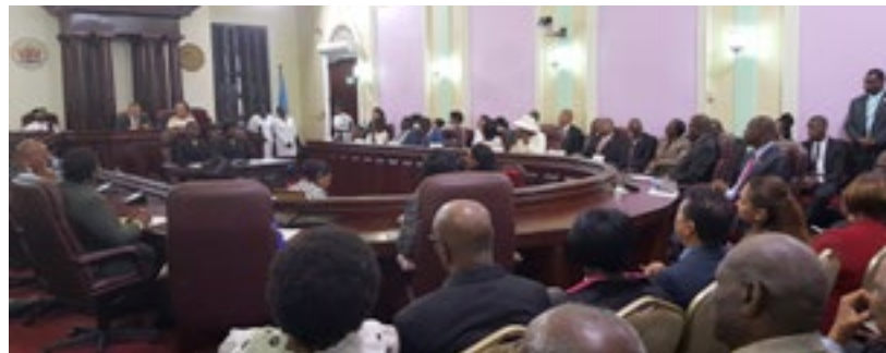
A cross section of the crowd at the 10th Inauguration Ceremony of the Tobago House of Assembly.