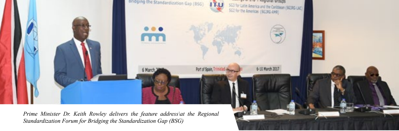
Prime Minister Dr. Keith Rowley delivers the feature address at the Regional Standardization Forum for Bridging the Standardization Gap (BSG)