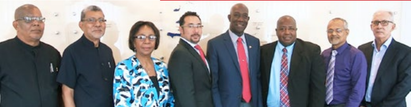
Prime Minister Dr. the Honourable Keith Rowley and Minister in the Office of the Prime Minister and Minister in the Office of the Attorney General and Legal Affairs, the Honourable Stuart Young, are pictured here with members of the Petrotrin Review Committee.