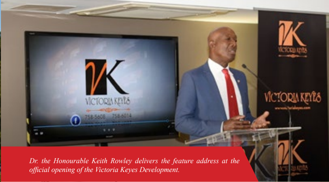
Dr. the Honourable Keith Rowley delivers the feature address at the official opening of the Victoria Keyes Development.