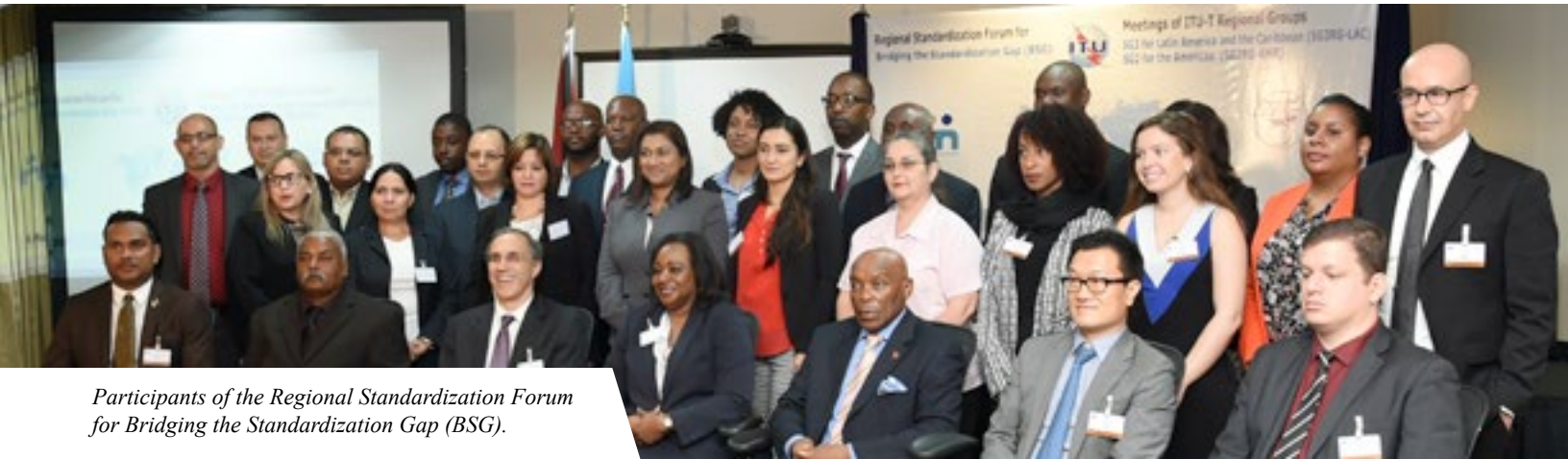
Participants of the Regional Standardization Forum for Bridging the Standardization Gap (BSG).