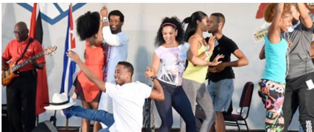
Above: Members of the El Conjunto Folklórico Nacional de Cuba during an impromptu performance for guests