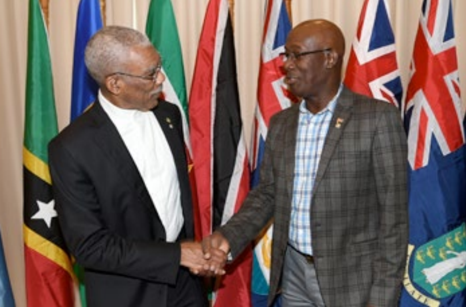
Left: Prime Minister, Dr. the Honourable Keith Rowley greets President of Guyana, His Excellency Brigadier (Ret'd) David A. Granger on the second and final day of the 28th Inter-Sessional meeting of the Conference of Heads of Government of the Caribbean Community (CARICOM) in Georgetown, Guyana.