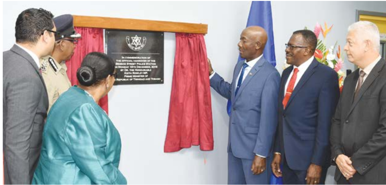
Prime Minister Rowley reveals the commemoration plaques at the newly constructed police stations at Besson Street (above) and St. Joseph (below).