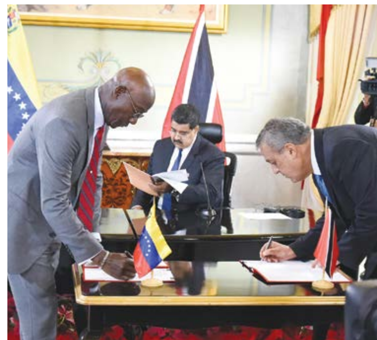
Prime Minister Dr. Rowley and PDVSA President, Eulogio del Pino, sign the energy cooperation agreement.