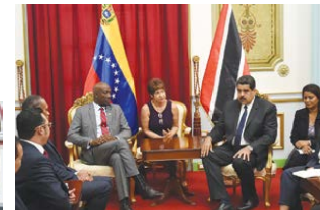
Members of the delegations from both Trinidad and Tobago and Venezuela during discussions.