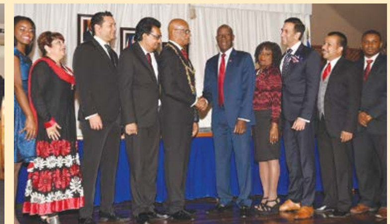
Prime Minister Rowley congratulates the newly elected Mayor of the City of San Fernando, His Worship Junia Regrello today (Wednesday 14th December, 2016). Looking on are members of Government as well as newly appointed members of the San Fernando City Corporation.