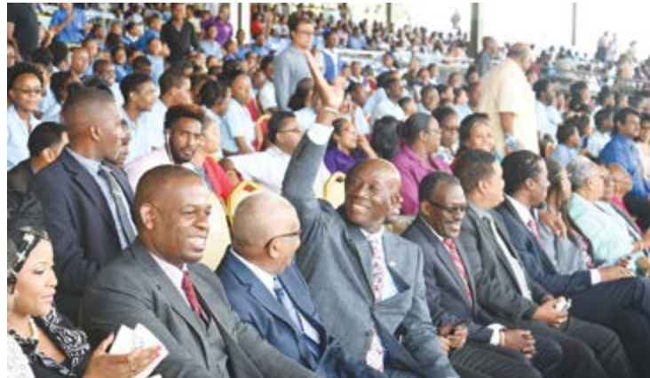
Prime Minister Rowley acknowledges the energetic greeting of students at the rally.

At the rally, Prime Minister Rowley encouraged students to never be deterred by anyone's underestimation of them saying, "We are not all the same but we are all very valuable... Children of Laventille, let nobody tell you what you should be – you must tell yourselves. Let no one tell you that you can't get there because of where you come from."