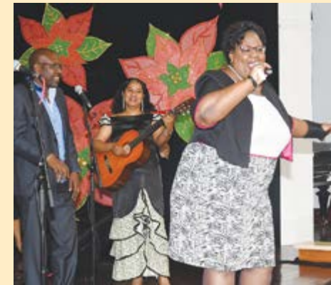
Members of staff of the OPM during an afternoon of merriment at the office's Christmas luncheon at the Diplomatic Centre, St. Ann's, Port of Spain.