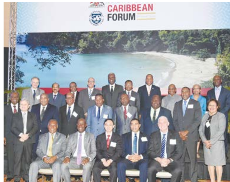
Prime Minister Dr. Rowley and delegates at the International Monetary Fund (IMF) 2016 High Level Caribbean Forum.