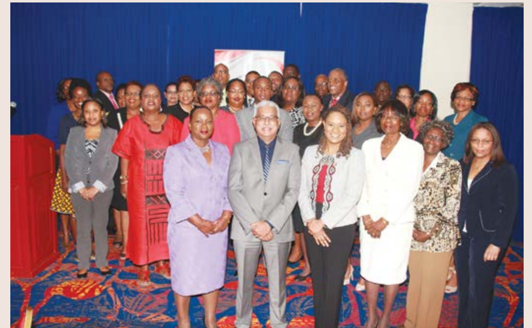
Minister of State in the Office of the Prime Minister, the Hon. Ayanna Webster-Roy, the Hon. Terrence Deyalsingh – Minister of Health, Minister of Social Development and Family Services – the Hon. Cherie-Ann Crichtlow-Cockburn and newly appointed members of the NACC.

Define a national HIV policy and provide guidance on sectoral policies