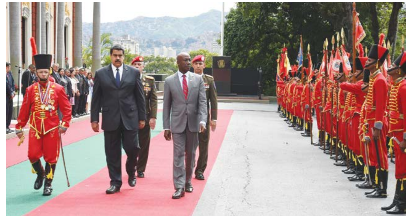
Prime Minister Rowley observes the Venezuelan guard of honour upon his arrival at the Presidential Palace in Caracas.

The new energy cooperation agreement will allow for a sustained a sufficient supply of gas from Venezuelan fields to industries in Trinidad and Tobago.