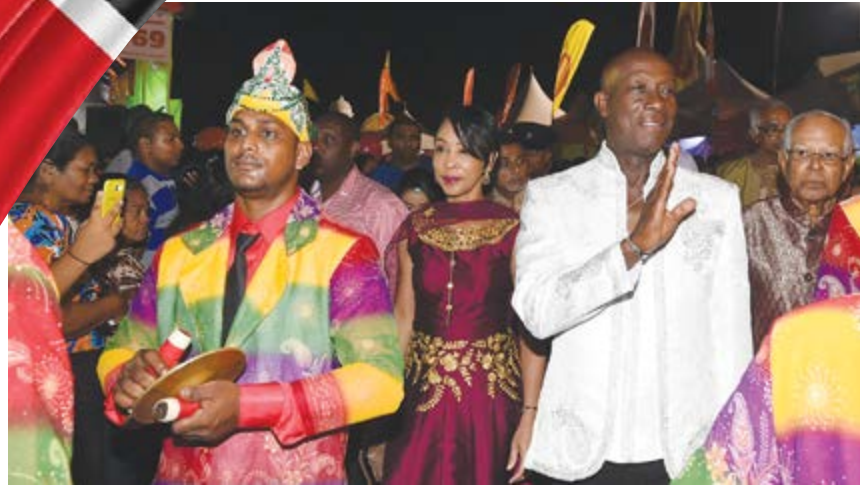
Prime Minister Rowley greets attendees at the Divali Nagar.