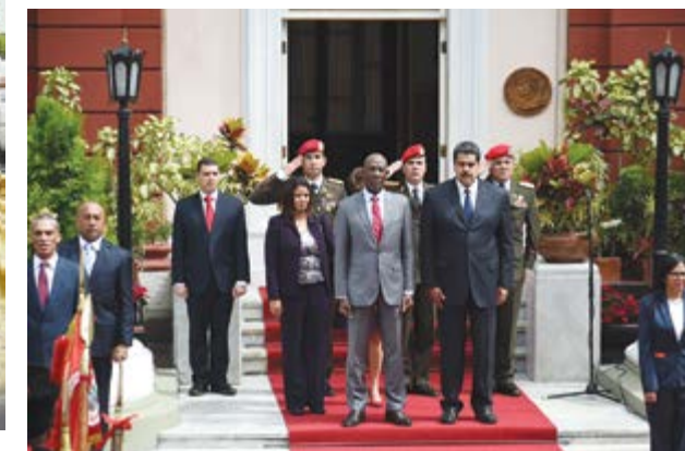
Prime Minister Keith Rowley and President Nicolás Maduro Moros during the salute by the Venezuelan guard of honour.